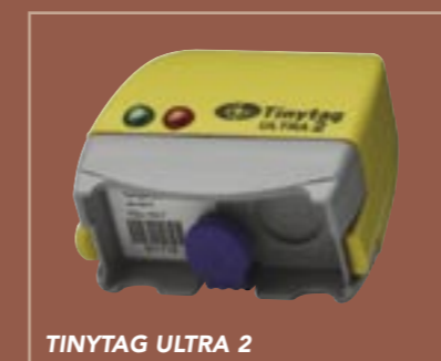
TINYTAG ULTRA 2