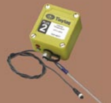
Place Data Logger in position to record and connect probe if required