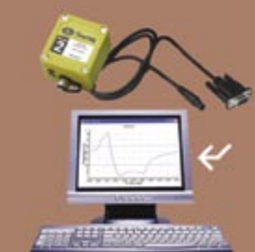
Connect Data Logger to PC, download and display the data