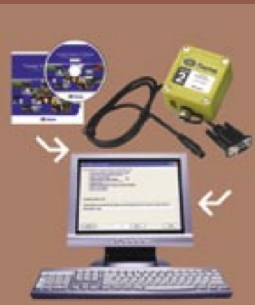
Install Tinytag Explorer software and connect data loggers to PC

For sealed-atmosphere cabinets, a probe version is available, where the logger can be mounted outside of the case being monitored.