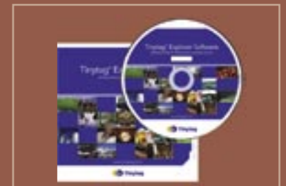
TINYTAG EXPLORER SOFTWARE

Tinytag Explorer is Windows based and user-friendly with simple steps to download and display data clearly as graphs and tables. Data can also be exported to other applications such as Excel.