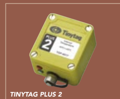
TINYTAG PLUS 2