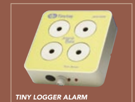
TINY LOGGER ALARM