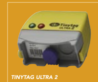
TINYTAG ULTRA 2

Made from food grade materials Tinyviews have an integral display for spot checks. Units with an external probe are used for monitoring fridges and freezers. The probe is located inside and the logger outside the storage space, so the display can be read without opening the door.