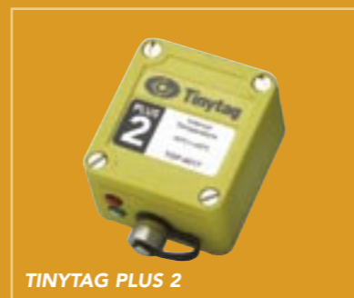
TINYTAG PLUS 2