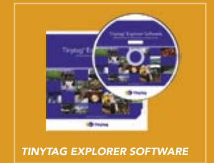
TINYTAG EXPLORER SOFTWARE

Tinytag Explorer is Windows based and user-friendly with simple steps to download and display data clearly as graphs and tables. Data can also be exported to other applications such as Excel.