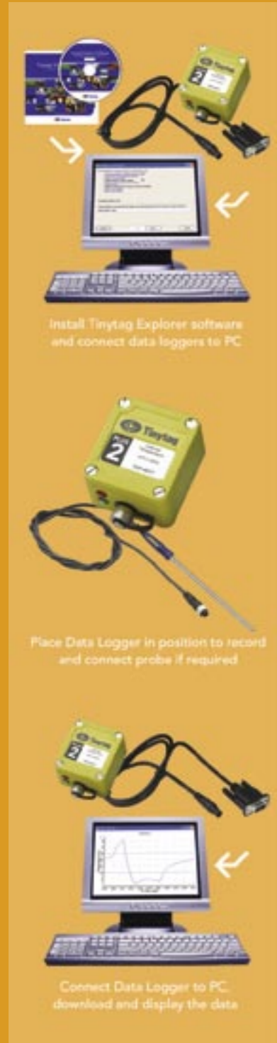
Install Tinytag Explorer software and connect data loggers to PC

Tinytags can be supplied with UKAS traceable calibration certificates for validation purposes.